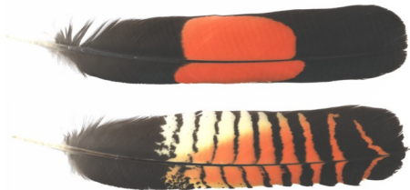
Male Tail Feather

Volunteer groups are able to search their allocated site at any time of the day, for as long as they want, on Saturday 7th May 2011 , however it is recommended that participants search either up until mid-day and/or from 3pm until dusk. This is when the birds tend to be more vocal and visible.